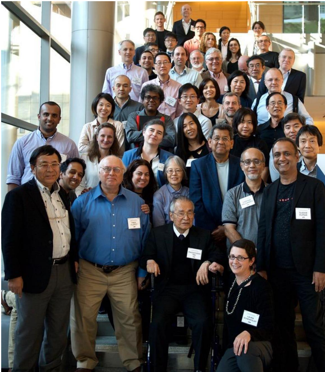
FIG. 4. Masatoshi Nei (first row, middle, in a wheelchair) with his students and other attendees of the 2017 symposium celebrating his achievements at Temple University.

“fashionable” trends in the field, commands admiration. Additionally, it is worth noting that the Hamming distance, an equivalent of p distance, is widely employed in machine learning and data science today.